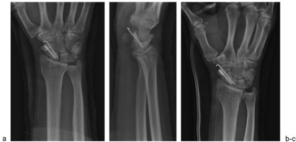
Fig. 3 (a) Anteroposterior (b) lateral (c) and oblique radiographs demonstrating restoration of the scaphoid normal anatomy with placement of a structural graft. The construct is stabilized with a cannulated headless screw and a de-rotational Kirschner wire.

the graft into place, followed by a headless screw (Acutrak, Acumed, Beaverton, OR) in the central portion of the scaphoid. The de-rotational K-wire was cut, then bent and left in place under the skin. (► Fig. 3 ). Additional cancellous graft was packed in around the nonunion. The radioscapocapitate ligament was repaired and the incisions on the wrist and iliac crest were closed in standard fashion. All wounds were dressed sterilely, and the patient was placed in a well-fitting thumb spica splint