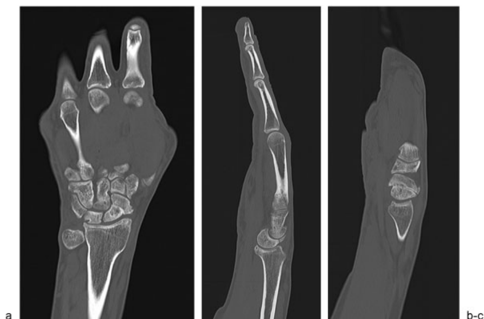
Fig. 2 Computed tomography scan images of the collapsed scaphoid. (a) Frontal view shows shortening of the scaphoid and large radial osteophyte. (b-c) Sagittal view demonstrates DISI deformity and shortening of scaphoid with humpback deformity.

The cancellous graft was first placed in the interstices of the proximal and distal scaphoid poles. The corticocancellous graft was then fashioned to fit the resulting structural defect and was impacted into place. Intra-operative imaging showed good restoration of the alignment of the scaphoid and a normal scapholunate angle. A 0.045 K-wire was used to pin